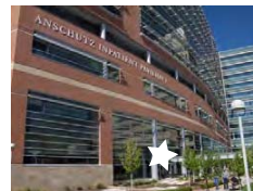
The east entrance to the Conference Center is marked by the white star.